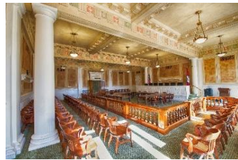
OLD SUPREME COURT