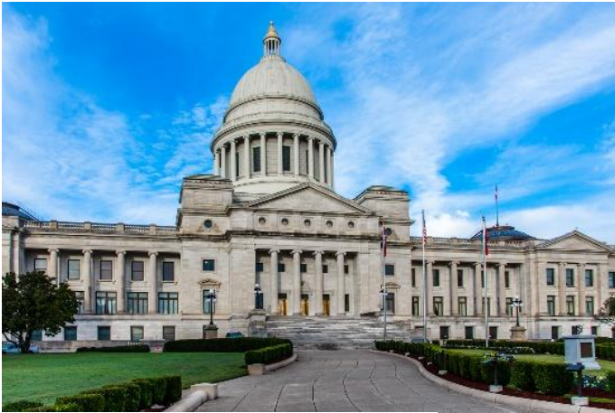
Ark. Capitol – Retro Rock Building the Ark. State Capitol.