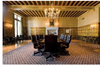
GOVERNORS RECEPTION ROOM