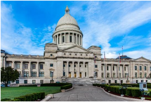
Ark. Capitol – Retro Rock Building the Ark. State Capitol.