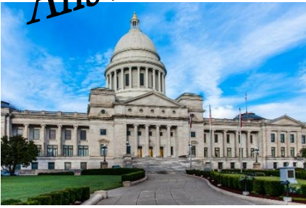
Ark. Capitol – Retro Rock Building the Ark. State Capitol.