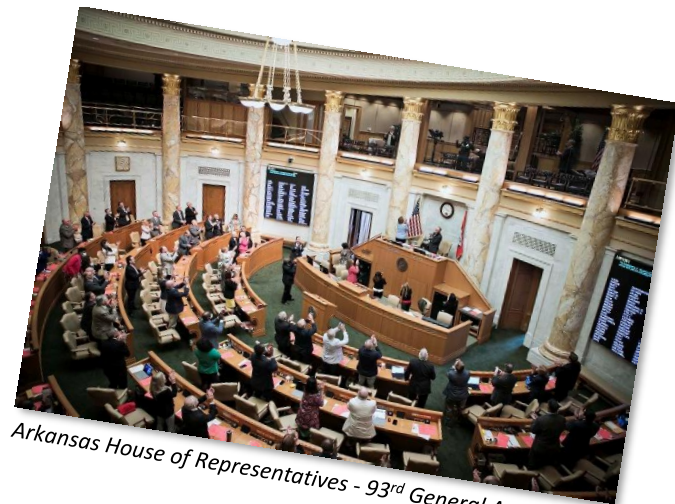
Arkansas House of Representatives - 93 rd General Assembly