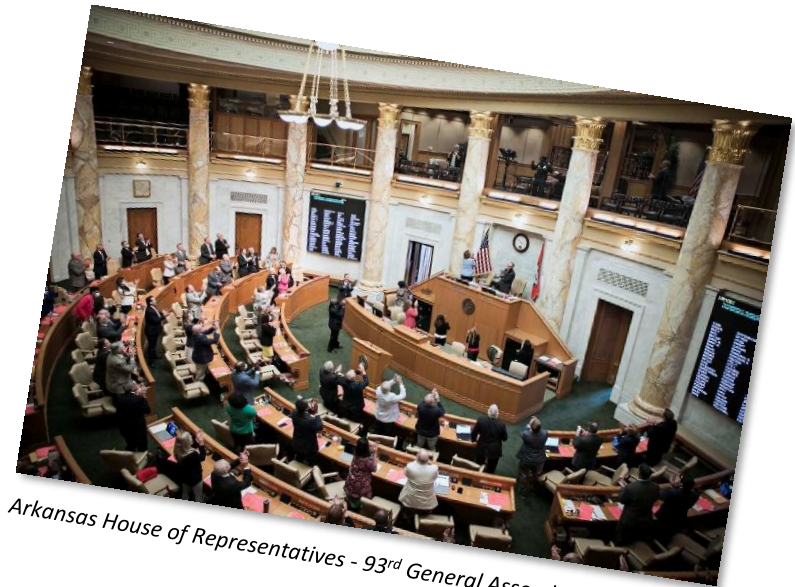
Arkansas House of Representatives - 93 rd General Assembly